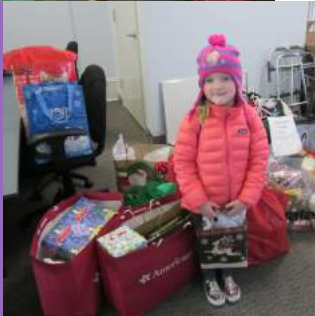
Some of our Santas and the goodies!