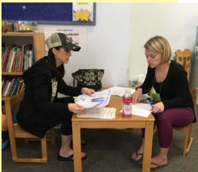
At times, every space available was in use!

Access to these critical services is now easier for Phoenixville residents.