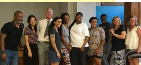
The first GLAD grads!

Proud member of Cc the Community Coalition